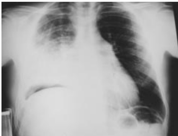
Figure 1 Chest radiograph obtained on the first postoperative day showing an infiltrate in the lower half of the right upper lobe.

A 29 year old white man underwent right middle and lower lobectomy to resect a well differentiated neuroendocrine carcinoma (atypical carcinoid tumour). An invasion of the right inferior pulmonary vein was detected and partial resection of the left atrium was necessary. The patient had an