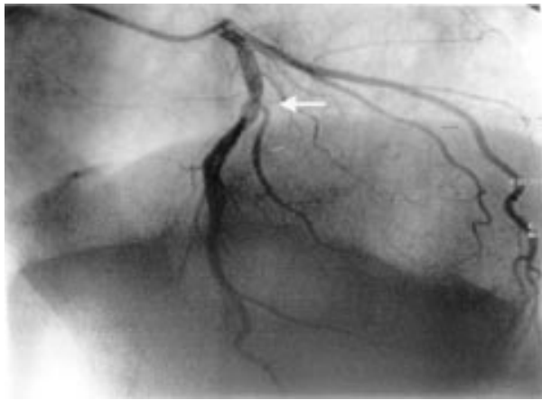
Figure 2 Coronary angiogram showing coronary artery spasm in the proximal left anterior descending artery.

and made an uneventful recovery. Bronchial lavage fluid grew Haemophilus influenzae and Staphylococcus aureus for which he was treated with oral clarithromycin. There was no evidence of any underlying malignancy.