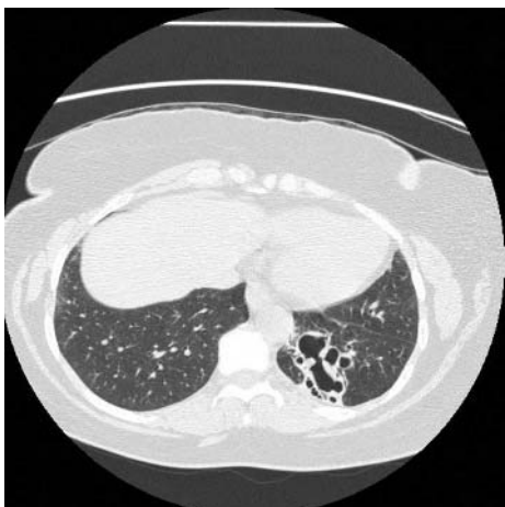
Figure 1 Thoracic CT scan showing cystic changes in the left lower lobe posterior segment.