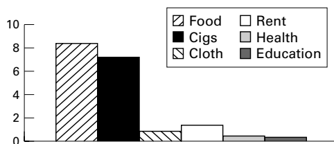
Figure 1 Men's monthly cigarette expenditures versus per capita monthly expenditure for basic needs, 1997. Cloth, clothing.

hukkas spend almost as much on tobacco as the per capita expenditure for housing, and over three times as much as the per capita expenditures for health and education. As there is no government support for the poor for clothing or housing, and virtually none for education or health care (per capita government spending on health in 1999 was $3.56 10 ) these numbers represent actual total expenditures on these items. Women's expenditure on average for cigarettes is more than half the per capita expenditure on food. Men spend more than 86% as much on their cigarettes as the average per capita expenditure on food. Spending per household on tobacco represents 1.3% of total household expenditure for rural areas, 3.3% for urban areas, or 1.4% for the country as a whole. 9