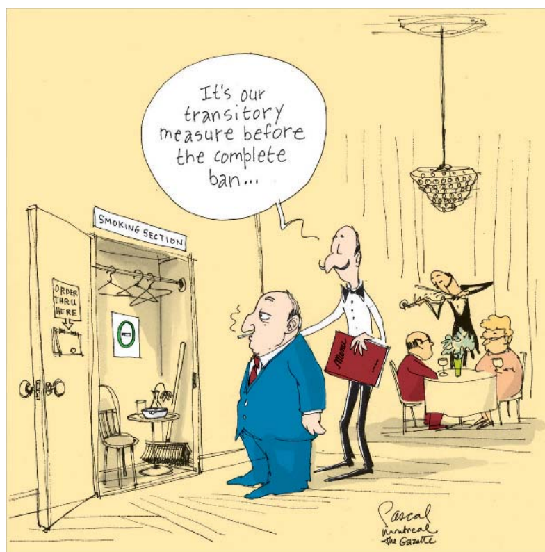
The Health Minister of Quebec announces plans to improve the Canadian province's Tobacco Act, eliminating all smoking from restaurants, bars, and other places inadequately covered by the existing law.