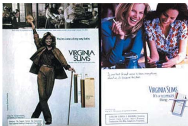
Figure 5 The left image is from the Virginia Slims “You’ve Come a Long Way, Baby” campaign in 1978; the right is from the “It’s a Woman Thing” campaign in 1997. Virginia Slims’ core user group was aging, and by the mid 1990s the feminist appeal of the long running “You’ve Come a Long Way, Baby” campaign was not well received by many younger women. PM recreated the Virginia Slims image by downplaying feminism and emphasising gender stereotyped female relationships. The caption of the right image reads, “If our best friend seems to know everything about us it’s because she does. Virginia Slims. It’s a woman thing”.

Stereotypical gender differences and a return to the traditional war of the sexes may act as a means of carving out the exclusive in-group to which women belong. Respondents in Marketing Perceptions’ research said, “Women build really close friendships. Men don’t seem to ever be as close... Guys go out to lunch to eat. Women go to chat”. 41 Similar statements are featured in Leo Burnett’s