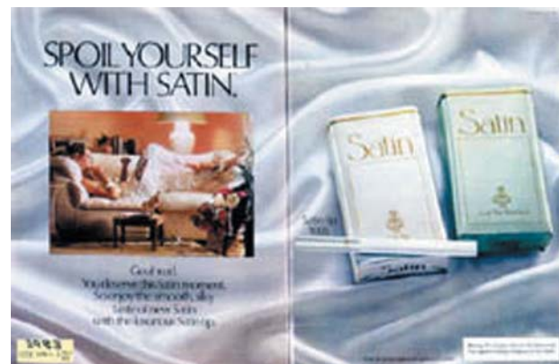
Figure 1 In this 1983 Satin “Couch” advertisement, the caption reads, “Go ahead. You deserve this Satin moment. So enjoy the smooth, silky taste of new Satin with the luxurious Satin tip”. With the Satin brand and advertising campaigns, Lorillard attempted to capture a sensuous image of highly feminine—not feminist—women. This campaign was designed to communicate a self indulgent, relaxing, escapist fantasy for mature, busy women, whether employed or not, who felt pressured by many demands on their time.

The 1982 Satin marketing strategy was “to convince the target that only Satin can pamper and gratify her special feminine needs and moods when it comes to smoking