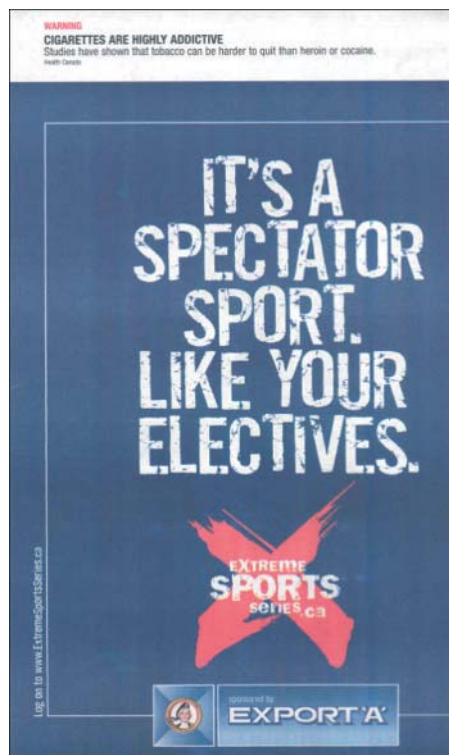
Figure 1 Campus newspaper advertising.

All analyses were conducted using SPSS (version 12.0). Given the organisational differences between colleges and universities described above, the results for these institutions are reported separately.