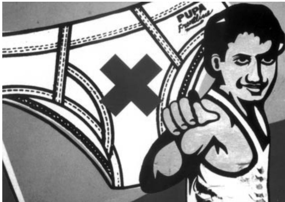
Smoking causes male sexual impotence. One of a series of postcards produced by ASH in the UK. The other side of the postcard states that 120,000 UK men in their 30s and 40s are currently impotent due to smoking and reports that a MORI poll conducted in April 1999 found that 88% of smokers failed to identify the link between impotence and smoking.