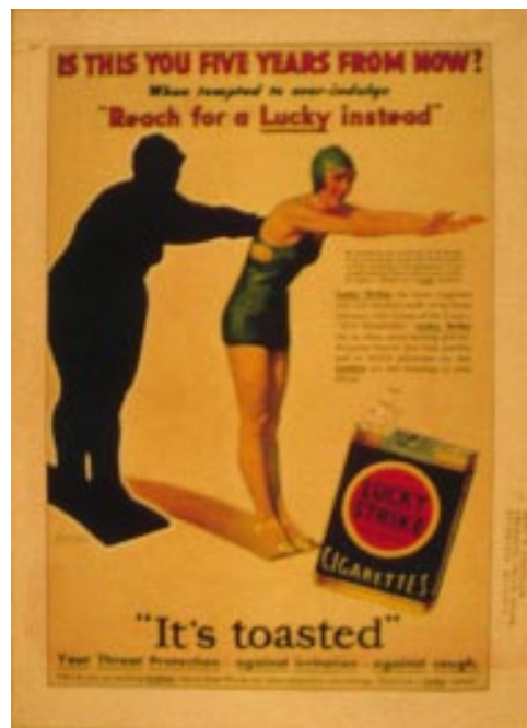
Figure 2 Lucky Strike ad.

wear trousers, play sports, cut their hair, and smoke. 3,4 Subsequently attitudes towards women smoking began to change, and more and more women started to use the cigarette as a weapon in their increasing challenge to traditional ideas about female behaviour. In powder rooms and rest rooms many women sought fellow smokers eager to push the limits of accepted social conventions. Soon the cigarette became a symbol of new roles and expectations of women's behaviour. However, it is questionable whether smoking would have become as popular among women as it did if tobacco companies had not seized on this opportunity in the 1920s and 1930s to exploit ideas of liberation, power, and other important values for women to recruit them to the cigarette market. In particular they needed to develop new social images and meanings for female smoking to overcome the association with louche and libidinous behaviour and morals. Smoking had to be repositioned as not only respectable but