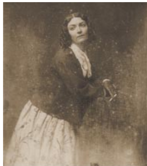
Figure 1 Lola Montez.

It is therefore remarkable that within 50 years of the invention of the mass produced cigarette, smoking among women in North America and northern Europe has become socially acceptable and even socially desirable. This was due not only to the dramatic changes in the social and economic status of women over this period, but also to the way in which the tobacco industry capitalised on changing social attitudes towards women by promoting smoking as a symbol of emancipation, a “torch of freedom”. This message is still being promoted today by the tobacco industry around the world, particularly in countries