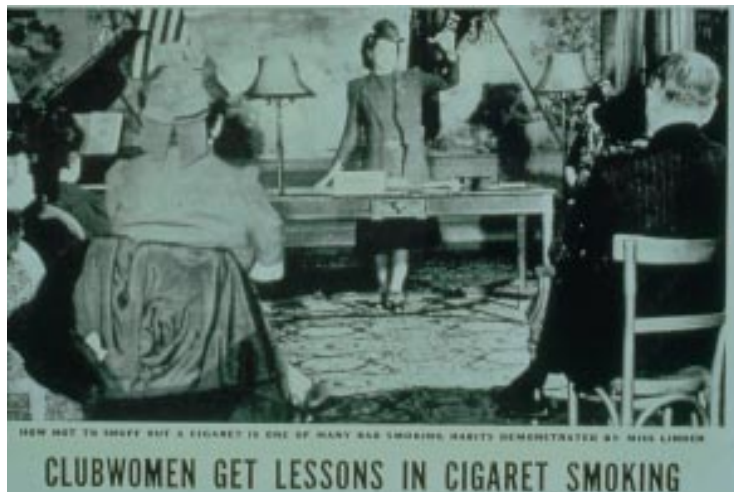
Figure 3 Lecture tour organised to give women lessons in smoking.

wear trousers, play sports, cut their hair, and smoke. 3,4 Subsequently attitudes towards women smoking began to change, and more and more women started to use the cigarette as a weapon in their increasing challenge to traditional ideas about female behaviour. In powder rooms and rest rooms many women sought fellow smokers eager to push the limits of accepted social conventions. Soon the cigarette became a symbol of new roles and expectations of women's behaviour. However, it is questionable whether smoking would have become as popular among women as it did if tobacco companies had not seized on this opportunity in the 1920s and 1930s to exploit ideas of liberation, power, and other important values for women to recruit them to the cigarette market. In particular they needed to develop new social images and meanings for female smoking to overcome the association with louche and libidinous behaviour and morals. Smoking had to be repositioned as not only respectable but