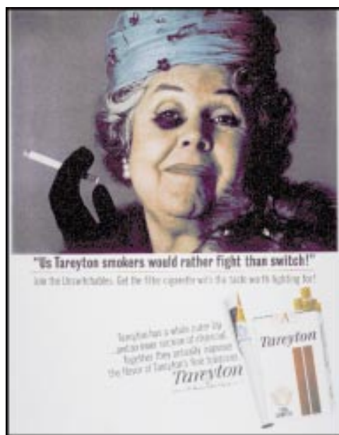
Figure 6 US Tareyton ad.

violence in order to defend their “right” to smoke (see cover). This startling and offensive message echoes one previously seen in the US in an ad for the brand Tareyton “the cigarette with the taste worth fighting for!” (fig 6).