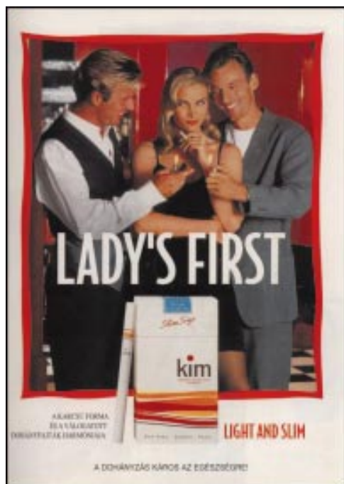
Figure 5 Hungarian Kim ad; Czech L&M ad.

Some of the most blatant targeting of women has occurred in the former socialist countries of central and eastern Europe, which are now exposed to the commercial forces of “free” markets, and have the highest rates of female smoking in the world. 9 Here cigarettes are promoted to women as a potent symbol of Western freedom, as in “Test the West”. In Hungary it is “Lady’s first” (sic), while in the Czech Republic young women are encouraged to join the men in their western male leisure pursuits (fig 5). Smoking rates among young women in these countries are increasing much more rapidly than countries where smoking took off earlier this century. In Lithuania, for example, smoking among women doubled over a five year period in the 1990s and increased by fivefold among the youngest groups (Stanikas T, personal communication, 1999). In Sweden, one of Lithuania’s neighbours, where women started to smoke in large numbers in the 1950s, it took almost 20 years for the female prevalence to double. Indeed one advertisement for West even suggested that women smokers would risk experiencing