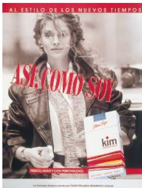
Figure 4 Spanish Kim ad.

the cultural meaning of women's smoking in these countries shifting from being a symbol of being bought by men (prostitute), to being like men (lesbian/mannish), to being able to attract men (glamorous/heterosexual). To this could also be added its symbolic value of being equal to men (feminism) and being your own woman (emancipation). However, despite this proliferation in messages and meanings it is striking how tobacco companies have continued to use imagery around emancipation, the cigarette as a “torch for freedom”, as they attempt to develop new markets among women around the world.