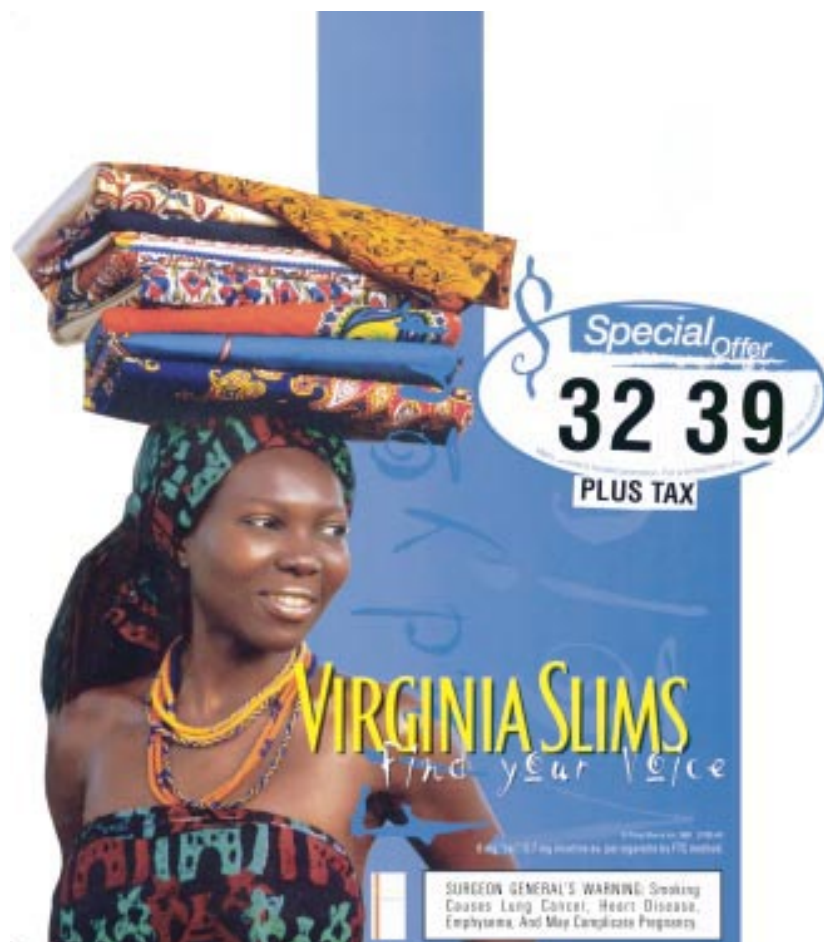
USA: Virginia Slims find your voice campaign. In what appears to be an appeal to back to roots sentiments, this advert portraying a woman in Africa is thought to be aimed at US African American women. It contrasts with cigarette advertising in African countries where western, especially American, models are often featured.

The attitude of the American delegation at the WHO consultative technical conference on the FCTC in New Delhi from 7 to 9 January 2000