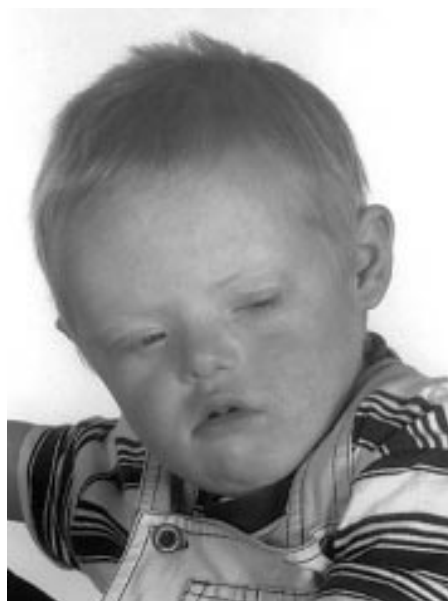
Figure 4 Regression of cushingoid features in case 1 after intranasal steroid therapy discontinued.