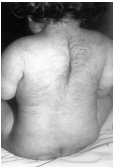
Figure 2 Hypertrichosis of the back caused by excessive intranasal steroid use in case 3.