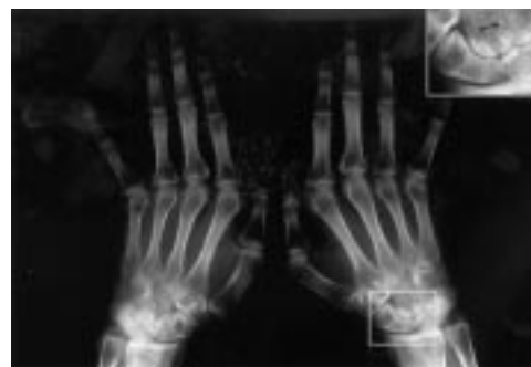
Figure 4 Radiograph of male patient with Jaccoud's arthropathy showing scapholunate dissociation leading to carpal collapse and mild ulnar translocation of the wrist.

of deforming arthropathy such as that seen in frank RA (rheumatoid hand) (fig 2). Using the modified index described by Spronk 7 we identified eight patients with Jaccoud's arthropathy (or so called lupus hand). This group is characterised by severe deformation (ulnar deviation, swan neck deformities, and Z deformity of the thumb) of the hands with multiple non-erosive subluxations, mild aching, and little or no evidence of synovitis (fig 3). Peripheral arthritis with mild deformity was seen in the remaining six patients. Table 2 gives the characteristics of the patient cohort. One third of patients with deforming arthropathy were receiving oral corticosteroid treatment (dose ranged from 5 to 20 mg/d, average 7.5) while a further 30% had received such treatment in the past.