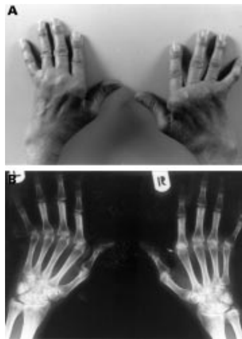
Figure 3 (A) Characteristic joint deviation with MCP subluxation, ulnar deviation, swan neck deformity of the fingers, and Z deformity of both thumbs in Jaccoud's arthropathy of the hands (lupus hand). (B) Radiograph of same hands showing hook formation (arrow) and alignment disorders without noticeable erosions.