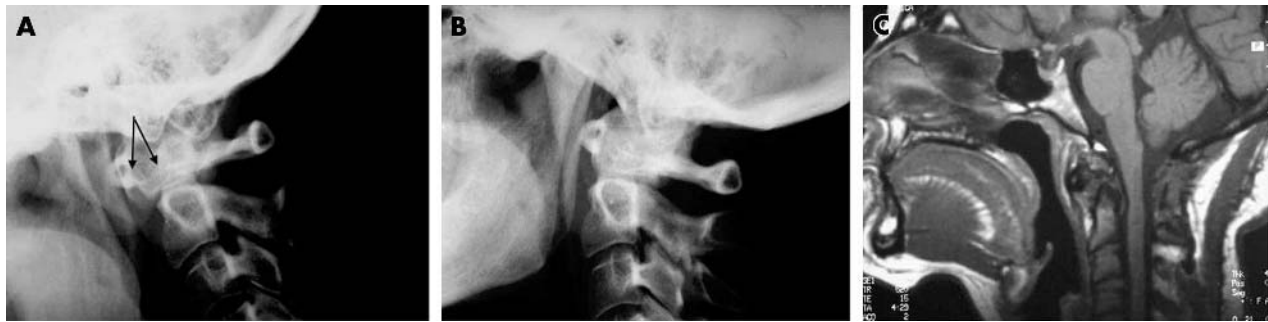
Figure 1 (A) Lateral view radiograph of the cervical spine (case 1) during flexion. Severe AAS is present (arrows show the anterior aspect of the dens of axis and the anterior arch of the atlas). (B) The AAS disappears during neutral posture. (C) Neutral position MRI examination of the cervical spine with the patient in a supine position. AAS is present, together with inflammatory tissue around the dens, but there is no compression of the spinal cord.

atlantoaxial disorders has been shown in a randomised trial. 13