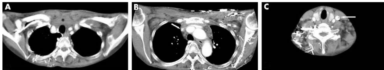
Figure 1 Contrast enhanced computed tomographic scans (A) demonstrating a soft tissue mass in the upper mediastinum (*); (B) showing almost complete occlusion of the SVC (arrow); and (C) thrombosis within the left internal jugular vein (arrow). In (C) The right internal jugular vein cannot be seen.

obstruction. 7 In one of the eight patients, thrombosis of the iliac vein was found in a patient with lumbar vertebral osteitis and a large tissue mass surrounding the vein. 8 The pathological mechanisms of venous thrombosis are still not clearly understood, but it is suggested that it is caused by vein compression by hyperostosis, or sheathing of the veins by an inflammatory and fibrotic tissue mass.