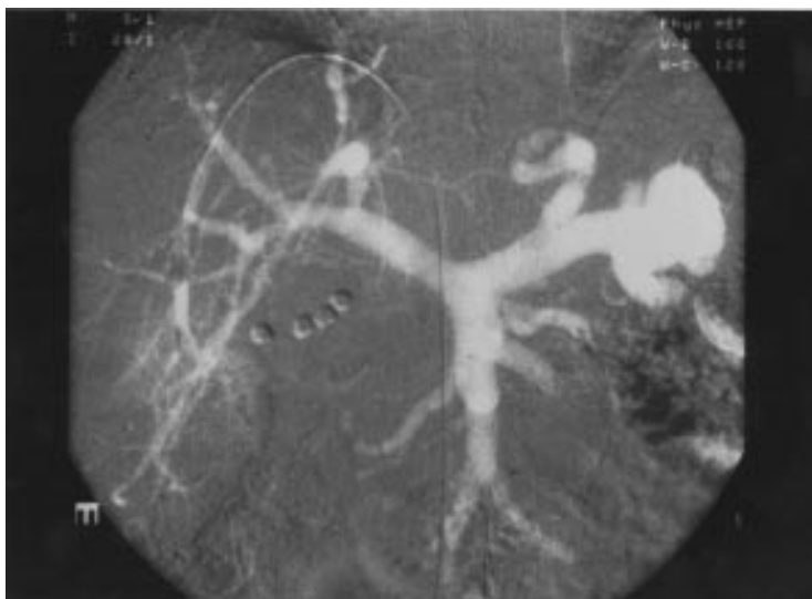
Figure 2 CO 2 venography allowed visualisation of the whole spleno-mesenteric-portal system, including the extrahepatic collaterals.

Of the 11 patients with cirrhosis in whom CO 2 venography did not allow visualisation of the portal vein, four had associated portal vein thrombosis which was confirmed by duplex Doppler ultrasonography and mesenteric angiography. In contrast, a patient suspected of having a portal thrombosis on sonography had a patent portal vein. Another five cirrhotic patients without visualisation of the portal vein on CO 2 venography had communications between different hepatic veins that precluded adequate wedged venography as the injected contrast escaped through another hepatic vein. Such veno-venous communications were uncommon among patients with cirrhosis in whom the portal vein was clearly demonstrated after retrograde CO 2 portography (6.6% v 45% in patients without visualisation of the portal vein, p=0.01 ). The remaining two patients in whom CO 2 venography did not demonstrate the portal vein had no particular characteristics.