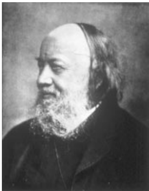
Figure 1 Edwin Chadwick.

Edwin Chadwick, the very name evokes powerful images of Britain at its most self confident and expansive. Victoria on the throne and the map of the world seemingly coloured pink. No challenge seemed too great for those mainly men who sought to conquer—other Peoples and Nations, the wilderness and the oceans and nature itself. Chadwick was truly a man of his times and a reflection of this unbounded self confidence, whose curiosity took him into a wide range of fields (fig 1).