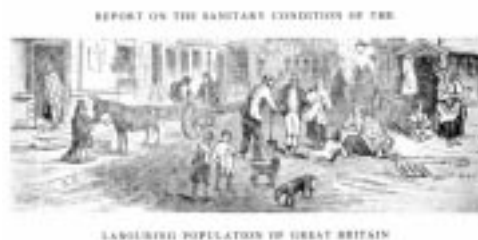
Figure 2 Frontispiece of sanitary commission.

Referring to the fact that ... "while Manchester has a very considerable commercial