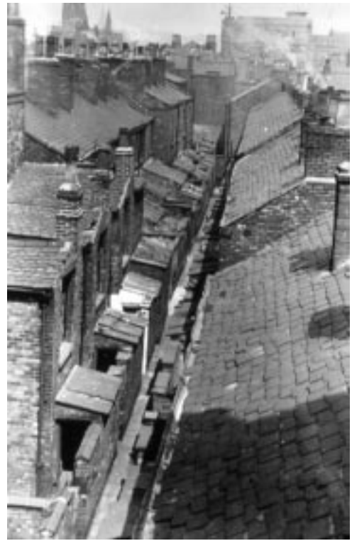
Figure 5 Slum housing and back to backs.