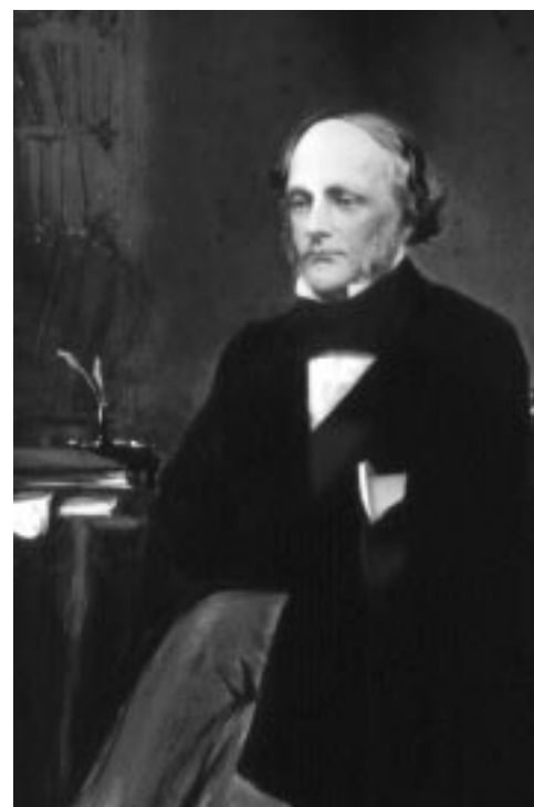
Figure 9 William Henry Duncan.

In among all the confusion that reigned about the causes of the cholera and other epidemic diseases in the mid-19th century with entrenched positions on the miasma by some and intransigent adherence to contagionism among