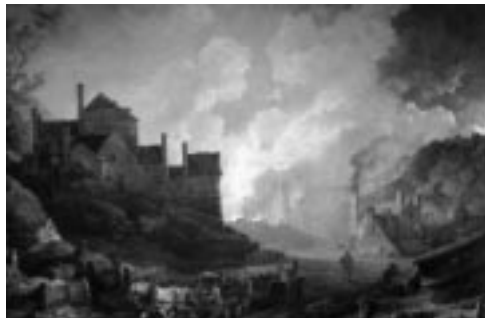
Figure 4 Ironbridge.

And on living conditions in the Old Town of Manchester... "between the northern boundary of the commercial district and the Irk...Todd Street, Long Millgate, Withy Grove, and Shude Hill...utterly horrible." Engels goes