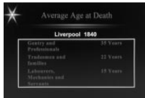
Figure 7 Average age at death. Liverpool 1840.

Chadwick was born in 1800, at Longsight, near Manchester, but moved to London with his father while still a child after his mother's