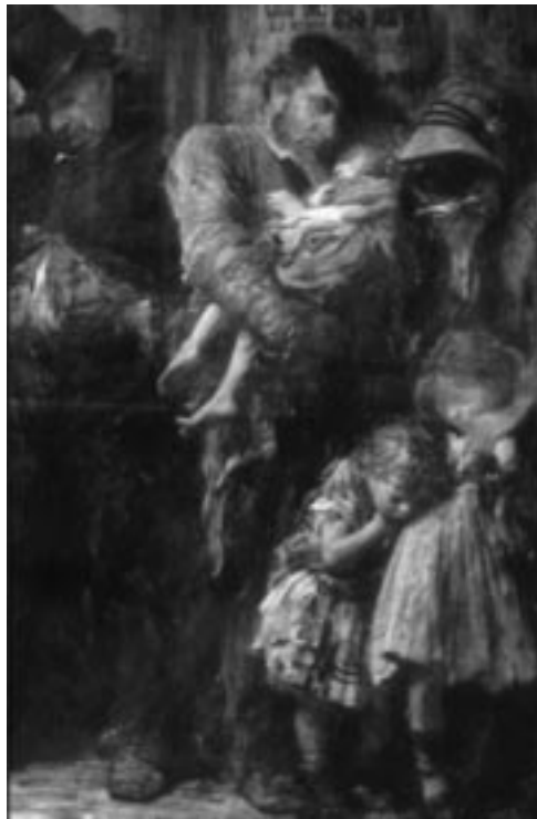
Figure 3 Luke Fildes. People waiting entrance to a casual ward.

population...Bolton, Preston, Wigan, Bury, Rochdale, Middleton, Heywood, Oldham, Ashton, Stalybridge, Stockport...though nearly all towns of thirty, fifty, seventy to ninety thousand inhabitants, are almost wholly working-people's districts. Among the worst of these towns after Preston and Oldham is Bolton. It has so far as I have been able to observe in my repeated visits, but one main street, a very dirty one, Deansgate, which serves as a market, and is even in the finest weather a dark, unattractive hole in spite of the fact that, except for the factories, its sides are formed by low one- and two storied houses. A dark coloured body of water, which leaves the beholder in doubt whether it is a brook or a long string of stagnant puddles, flows through the town and contributes its share to the pollution of the air, by no means pure without it..." (fig 5 and fig 6).