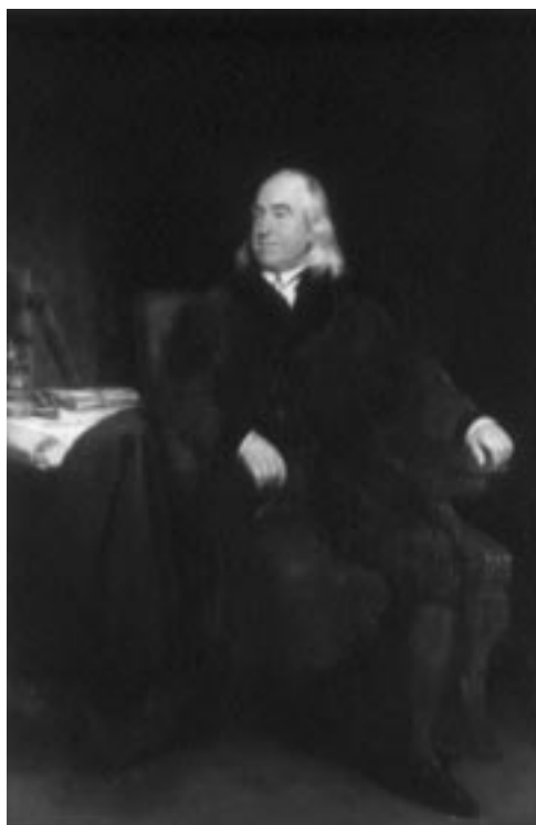
Figure 8 Jeremy Bentham.