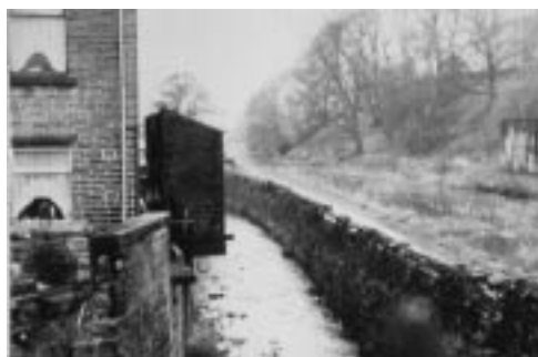
Figure 10 Overwater latrine.