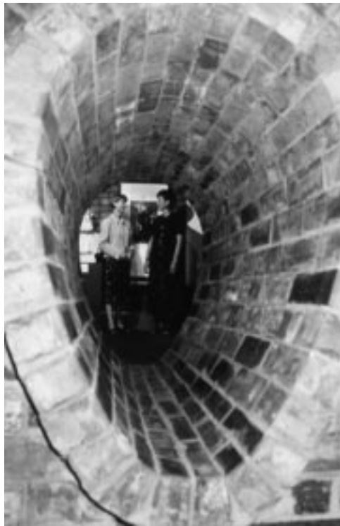
Figure 11 Egg shaped sewer.

existed or made up of elected representatives in areas with non-corporate towns. There were to be local medical officers of health: