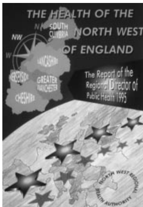
Figure 13 Report of North West Health.

the midst of a revolution, this time an information revolution, rather than a sanitary one. We are in the middle of a period of massive structural adjustment with traumatic implications for labour markets and this time global migration and mega-urbanisation and suburbanisation. Our lives have been transformed by the internal combustion engine, rapid transit and air travel and the communications revolution. If Chadwick's egg-shaped sewer was paradigmatic of the industrial age the fibre optic cable is likely to be its equivalent today (fig 11).