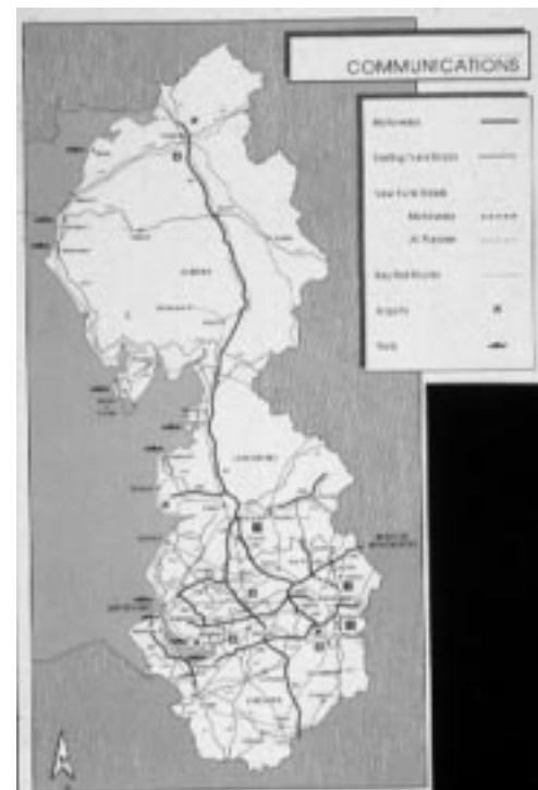
Figure 12 North West Region communications.

In 1997 looking back for over a century we are perhaps in a position to see how far we have come and to have some indication as to how far and where we may choose to go. Certainly there may be lessons to learn. 15 We are again in