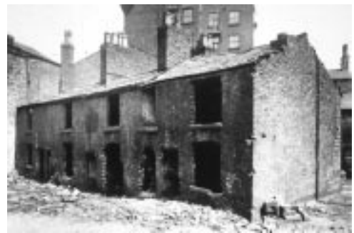
Figure 6 Slum housing and back to backs.

on to describe "Below (Ducie) bridge you look down upon the piles of debris, the refuse, filth, and offal from the courts..." And "...passing along a rough bank, among stakes and washing-lines, one penetrates into this chaos of small one-storied, one-roomed huts, in most of which there is no artificial floor; kitchen, living and sleeping-room all in one. Privies are so rare here that they are filled up every day, or are too remote for most of the inhabitants to use". The Health of Towns Commission had in fact recently reported that of 50 large towns examined in 1843-4, there was hardly one in which the drainage was good, and only six where the water supply was good. In parts of Manchester 33 privies had to supply over 7000 people—one for every 215. 1