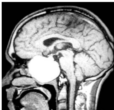
Figure 2 MRI of the brain showing mucocoele in the sphenoid sinus.

A 22 year old man presented with acute onset of loss of vision in the right eye of six hours' duration. There were no associated complaints of pain or redness of eye. There was no associated convulsion or alteration in sensorium. He complained of a mild headache over the past two days. On examination the perception of light in the right eye was absent. Light and accommodation reflex testing revealed a right afferent abnormality. Funduscopy showed blurred disc margins and pallor of the right optic disc. Eye movements were normal and painless. There was no other focal neurological deficit.