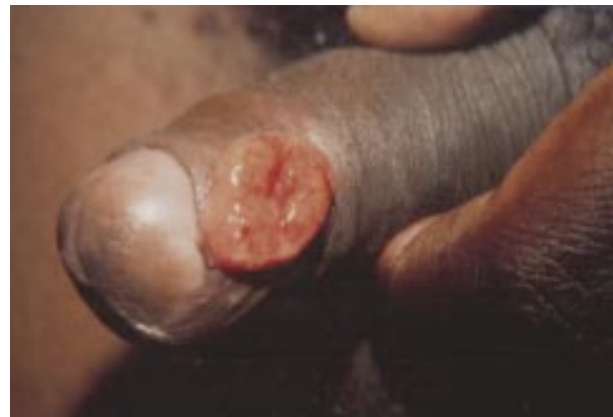
Figure 2 Hypertrophic donovanosis ulcer with a regular margin.