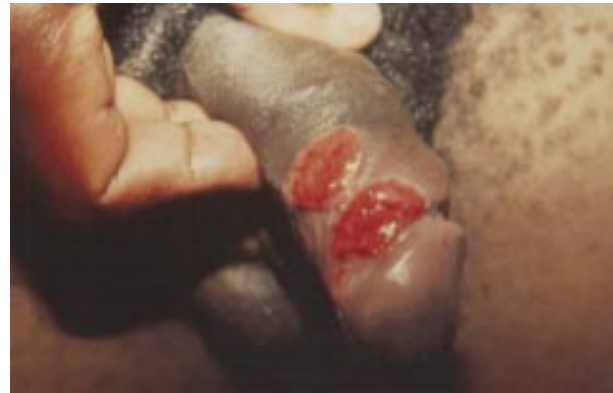
Figure 1 Typical beefy red donovanosis penile ulcer.

The latter contention is supported by both the low co-infection rates in sexual partners of index cases in Papua New Guinea and the United States 24, 25 but contradicted by both a history in index cases of sexual contact with specific female sex workers 26, 27 and the higher prevalence in sexual partners in India where 26 (52%) partners of 50/165 index cases, were co-infected with donovanosis. 28 Cases in children are often attributed to sitting on the laps of infected adults rather than sexual abuse. 29 Transmission may occur during vaginal delivery and careful cleansing of neonates born to infected mothers is recommended. 30