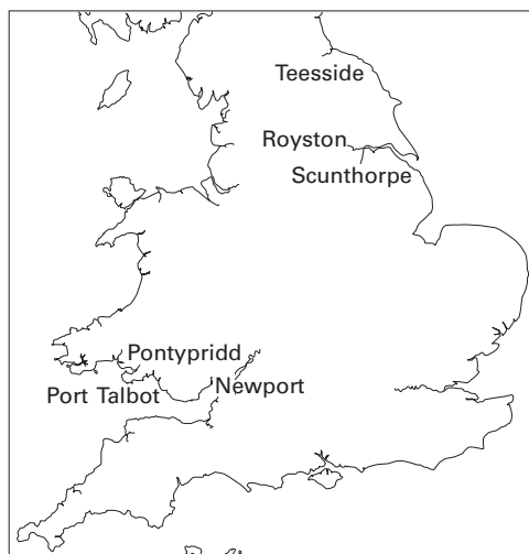
Figure 1 Location of six groups of operating coke works operational in England and Wales in 1995.

Estimates of association with proximity to each coke works were then combined in a Bayesian hierarchical (random effects) model using the BUGS software 27 in order to find an overall estimate of association.