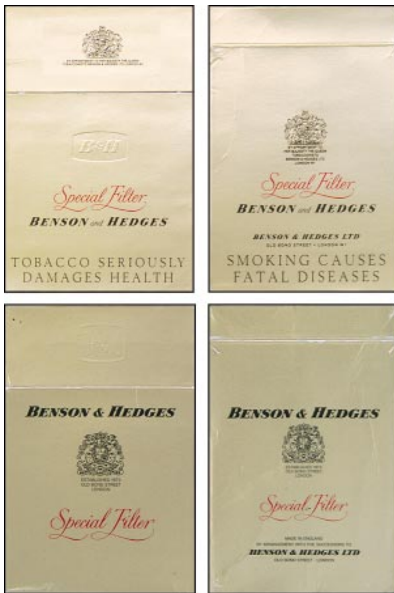
Top row: the crests on the lid (left) and back of the Benson & Hedges pack made and sold in the United Kingdom by Gallaher are the royal coat of arms, with the caption: "By appointment to Her Majesty the Queen, tobacconists, Benson & Hedges Ltd, London W1". Bottom row: this pack, made by BAT and bought in India, carries on the front and back a different crest, closely resembling the royal coat of arms, with a caption saying: "Established 1873, Old Bond Street, London".

Just how important the royal warrant has been to enhance the unenhanceable can be seen in India, the most populous commonwealth country, where the B&H brand is made and sold by BAT. If you haven't got the warrant, why not invent a clever copy? Little different, really, than close copies of Lacoste leisurewear, or Rolex watches. Our picture shows the Indian B&H pack, complete with lookalike coat of arms, and the British version, destined soon to be a collectors' item, or an exhibit in a public health museum in the United Kingdom.