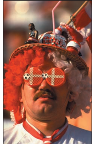
Dane, at peace