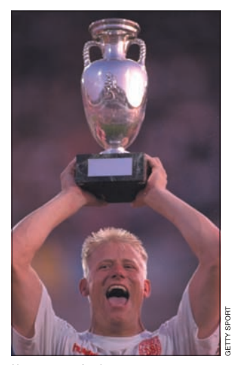
Happy ever after?

changes as a result of a higher income.<sup>8</sup> Denmark ranks number one in the Gini index, which is a measure of income equality,<sup>9</sup> 10 but is closely followed by Sweden, which is second in Europe. Virtually all historically Protestant societies show relatively high levels of subjective wellbeing.<sup>3</sup> But again, Denmark does not differ much from Sweden and Finland in infrequency of church attendance or latent paganism.