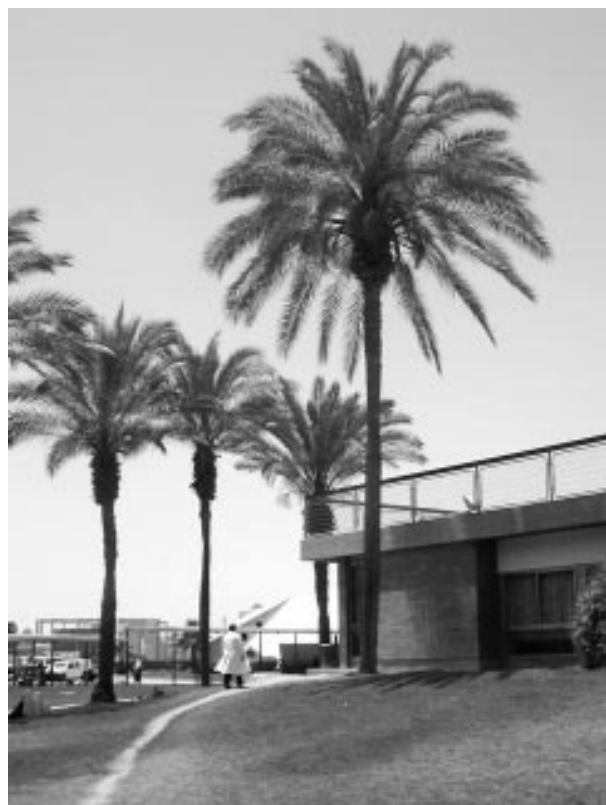
Figure 2 The date palm ( Phoenix dactylifera ).