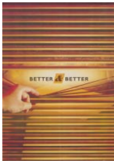
Benson & Hedges' indirect marketing campaign exploits recognition of the familiar ampersand.

stages, until only the ampersand remains; a similar development is expected in television ads. Meanwhile the Malaysian public has been slowly trained to associate the ampersand with the cigarette brand name. It seems obvious that one goal of this exercise is to prepare the public for the day when cigarette brand names will be banned in any promotions, in the hope that the ban is sufficiently badly drafted to let the "&" get through.