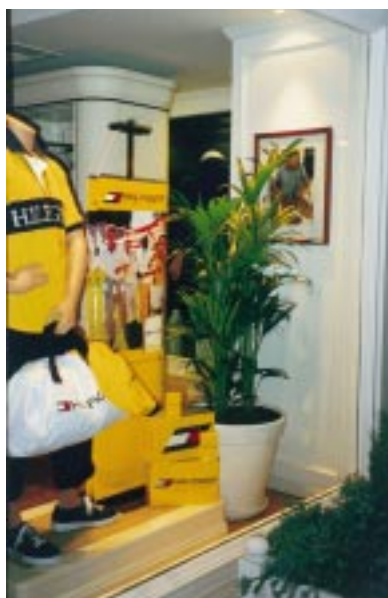
The Istanbul branch of Tommy Hilfiger prominently displayed Marlboro F1 clothing and pictures (left), until replaced (right) after the Turkish committee on smoking and health threatened legal action.