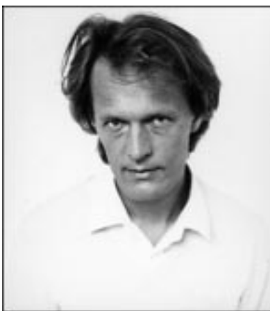
Sir Richard Peto.

Peto's clear, simple messages range from his classic 1980s British projections of the early deaths that would occur among 1000 young smokers, to his more recent work with the World Health Organization's Alan Lopez and others, analysing mortality data in Europe, and projecting global mortality from tobacco. But probably his greatest achievements so far are associated with China. Peto was among the first to realise that China's vast size, with some provinces having larger populations than the entire United States, coupled with sharp inter-regional gradients for certain key causative factors, and high standards of science, offered exceptional potential for research, especially with regard to cancer. It is no surprise that the research unit Peto co-directs with Professor Rory Collins in Oxford has a significant number of Chinese scientists, and is working on several important Chinese studies. At the end of last year, his idea for a massive "counting the dead" study evaluating the present and future burden of tobacco-induced mortality in China came to fruition, gaining widespread media attention around the world.