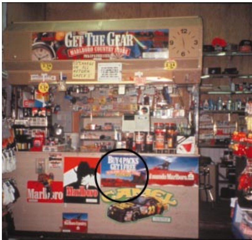
A typical point-of-sale display featuring special promotions (circled) and tobacco advertising.