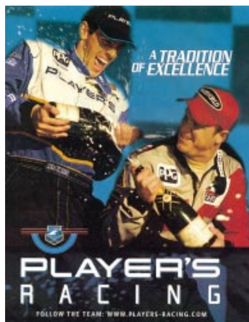
Figure 2 Racing hero enjoys enviable success.

The portrayals of the extremely risky sports in recent Export “A” ads have many consistencies, such as the extreme close up on the head of the solo athlete shown, who wears mirrored sunglasses reflecting their sport (fig 3). The sunglasses add several interesting dimensions