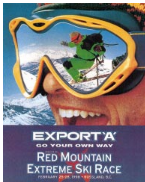
Figure 3 Sport and brand reflecting identity.

to the image. Expensive sport sunglasses are a much prized symbol of status among the young. Their mirrored surfaces add an element of ambiguity and mystery that more readily permits viewers to project themselves into the scene and identify with the image. Perhaps most importantly, digital image manipulation allows the visual to simulate how people are reflected in the mirrored lenses. This resonates with the concerns of the young as to how they will appear to their peers.