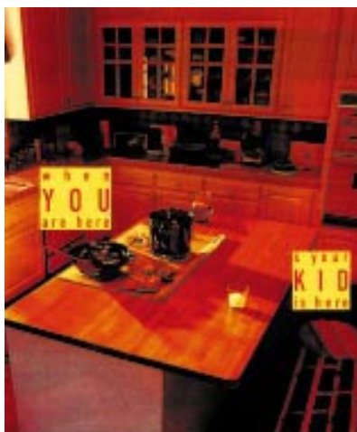
The Philip Morris advertisement in the November 2000 edition of "Good Housekeeping".

At the front of the November 2000 edition, beside a photograph of the editor, was a trailer for what was