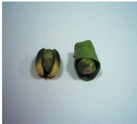
Different betel quids: Left: A split areca nut sandwiched with betel flower, spiced with red lime. Right: A whole areca fruit is wrapped with betel leaves, spread with white lime