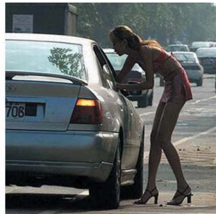
Betel Quid Barbie catering to motorists, selling betel quid and cigarettes