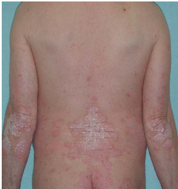
Figure 1 Symmetrical distribution of psoriatic lesions on the back and elbows.

various types and presentations of psoriasis are outlined below.