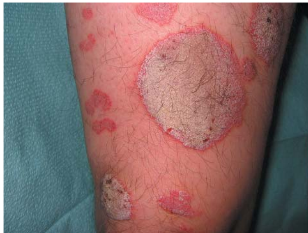
Figure 2 Nummular (coin-sized) lesions of psoriasis.

Guttate psoriasis, from the Greek word gutta meaning a droplet, describes the acute onset of a myriad of small,