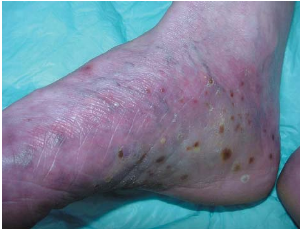
Figure 3 Palmoplantar pustulosis.