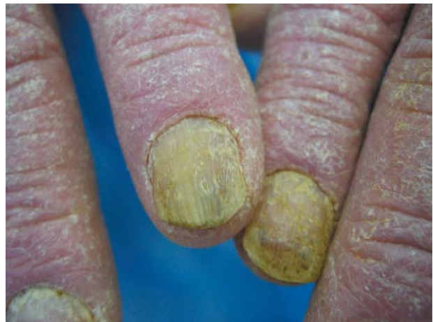
Figure 5 Nail plates in a patient with psoriasis. They are thickened, dystrophic, and show orange-yellow areas (oil spots).

everyday disability leading to depression and suicidal ideation in more than 5% of patients. 28