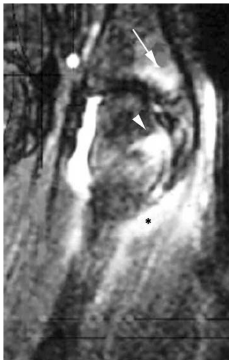
Figure 2 Fat suppressed MRI of the metacarpophalangeal (MCP) joint in a patient with psoriatic arthritis shows extracapsular inflammation (asterisk), bone oedema at the distal capsular enthesis (arrow), and bone oedema in the MCP head region where bone oedema and erosions may also occur in rheumatoid arthritis (arrowhead).

enthesitis difficult, especially at sites of synovitis. Due to the intimate anatomical association of synovium and the enthesis at many sites, it would be improbable that enthesis based disease would not incite an inflammatory response within the closely juxtaposed synovial tissue, 18 which is supported by the observation that resident cells in the latter can be triggered by diverse proinflammatory cues. 18 Figure 3 demonstrates the close link between enthesitis and synovitis in a patient with PsA.