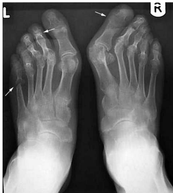
Figure 3 Radiograph of the feet of a patient with symmetrical polyarthritis with ulnar deviation of the hands and fibular deviation of the feet. The radiograph reveals joint fusion at multiple sites (arrows on top) and the fifth left metatarsal phalangeal head and adjacent proximal phalanx demonstrate pencil in cup deformity (arrow on left), features which help distinguish this as psoriatic arthritis rather than rheumatoid arthritis (RA). This case illustrates how imaging has the potential to clarify that the diagnosis is what clinically masquerades as RA.