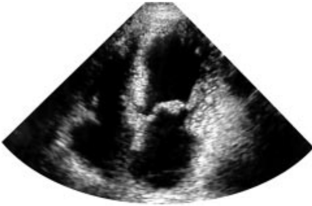
Figure 2 Ten years after surgery, echocardiography shows no evidence of infiltration.

Postoperatively, she received corticosteroids, warfarin, azathioprine, aspirin, and dipyridamole. Progress was slow but the heart failure, visual impairment, and neuropathy resolved. It was possible to simplify the regimen to warfarin and prednisolone, the dose averaging about 5 mg daily and being adjusted carefully to maintain a normal blood eosinophil count. She has continued to require inhaled asthma medication. She remains in good health at 10 years after surgery and the echocardiogram is now normal (fig 2).