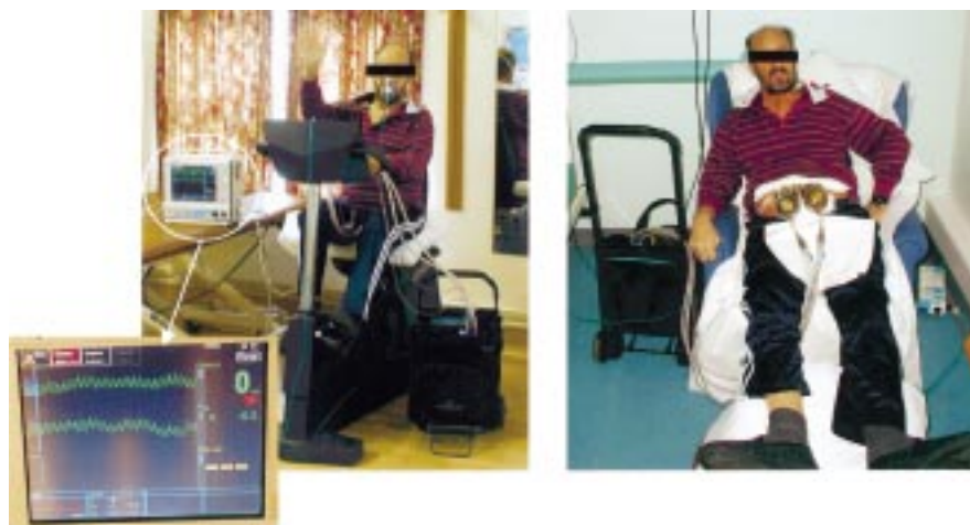
Patient on exercise bicycle (left) and at rest (right). Inset: Underlying rhythm of ventricular tachycardia on ECG monitor. The exposed extra-corporeal ventricular assist devices are seen resting on the patient's abdomen. The portable ventricular device console is present on the left. A haemofiltration catheter is visible on the right side of the patient's neck. The motion artefact seen on the monitor in the main picture is abolished in the inset picture taken at rest.

Implantation of ventricular assist devices as a bridge to transplantation or recovery is predominantly for intractable heart failure. Biventricular assist devices account for approximately 20% of these procedures. Significant ventricular arrhythmias are rare following such operations, but they can result in abnormal pump performance, embolic