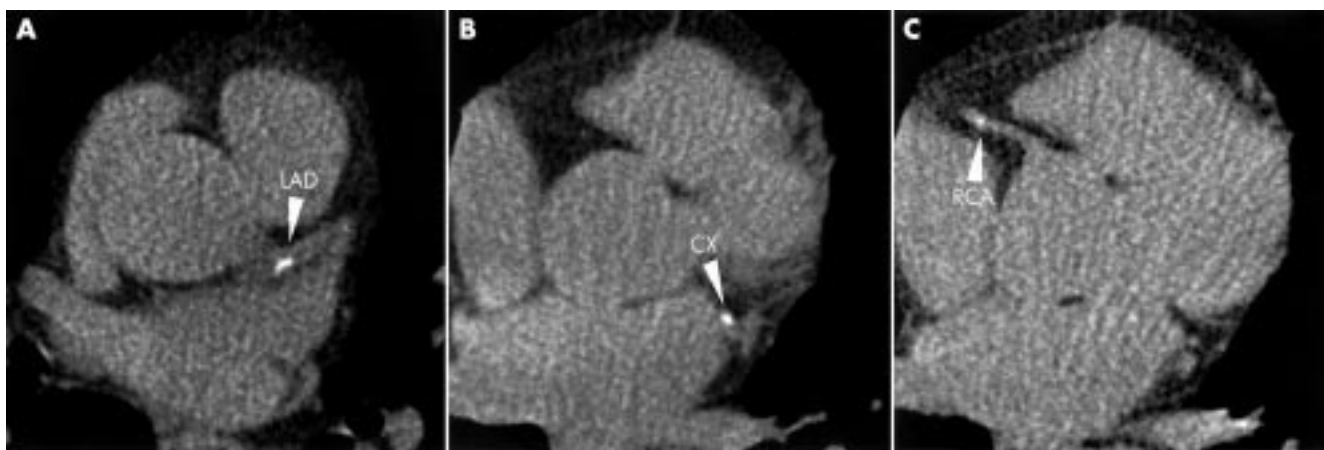
Figure 2 Panels A–C: Cross sections of the heart of a 28 year old male patient after an acute anterior myocardial infarct, showing coronary calcifications (arrowheads) in all coronary vessels (LAD, left anterior descending coronary artery; CX, circumflex artery; RCA, right coronary artery).

Our study was intended to detect and quantify coronary calcification in a younger population with a first unheralded myocardial infarct, and to make comparisons with controls matched for age and risk factors. However, it has some limitations. The controls were selected retrospectively from among individuals who had previously been referred for scanning. These individuals may have been preselected. Second, even though a significant difference in the presence and extent of coronary calcification between patients with and without myocardial infarction could be shown, the sample size was too