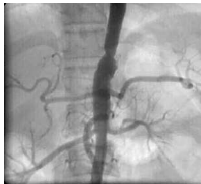
Aortogram showing narrowing of the supra renal aorta.