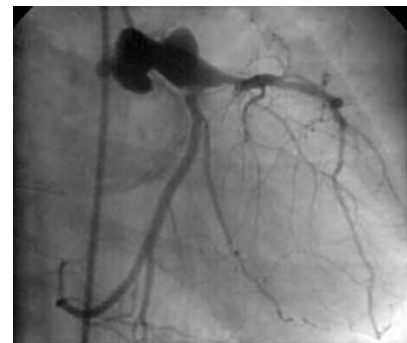
Coronary angiogram in the right anterior oblique showing aneurysm of the left main coronary artery.