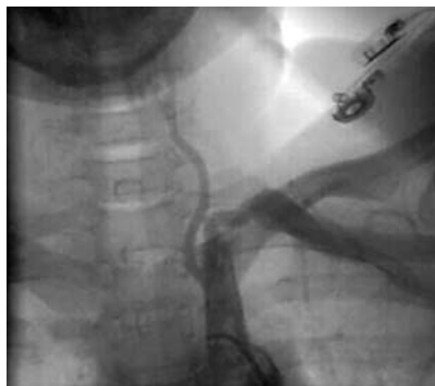
Left subclavian angiogram showing the characteristic narrowing in the subclavian artery.