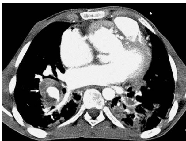
Figure 1 Contrast enhanced computed tomography of chest showing extensive consolidation in both lower lobes representing either infarct or infection. The rounded area of consolidation in the right lower lobe is suggestive of thrombus in the right pulmonary artery with surrounding haemorrhagic infarct (arrowed).

While awaiting further investigations, his condition abruptly deteriorated with massive haemoptysis (500 ml in 10 minutes) resulting in profound hypoxia and haemodynamic compromise. He was resuscitated and transferred to the intensive care unit (ICU). Flexible bronchoscopy found bleeding from the right middle bronchus. Chest computed tomography revealed a right lower lobe pulmonary artery aneurysm with thrombus and surrounding haemorrhagic infarct (fig 1). Transoesophageal echocardiography demonstrated vegetations on a thickened and severely regurgitant conduit valve. Serial sputum and blood cultures had been sterile. Nevertheless, he was treated empirically with teicoplanin, ceftazidime, and gentamicin. Persistent bleeding necessitated de-clotting of the airways via rigid bronchoscopy, but it was felt that he would not tolerate surgical