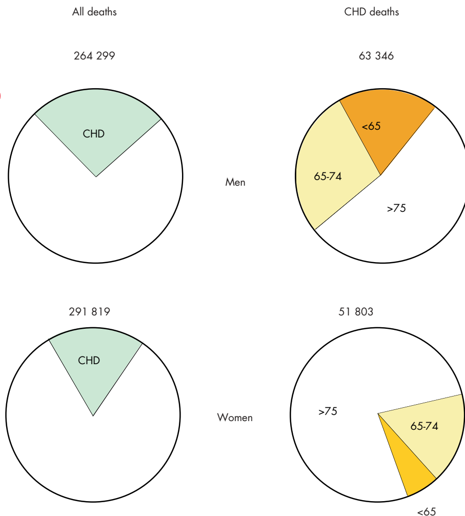
Figure 1 Pie diagrams of total and coronary heart disease (CHD) mortality in England and Wales in 1999 (National Statistics).

changes may achieve the less stringent target values of < 4.1 mmol/l and < 3.4 mmol/l recommended for those at low and moderate risk, respectively.