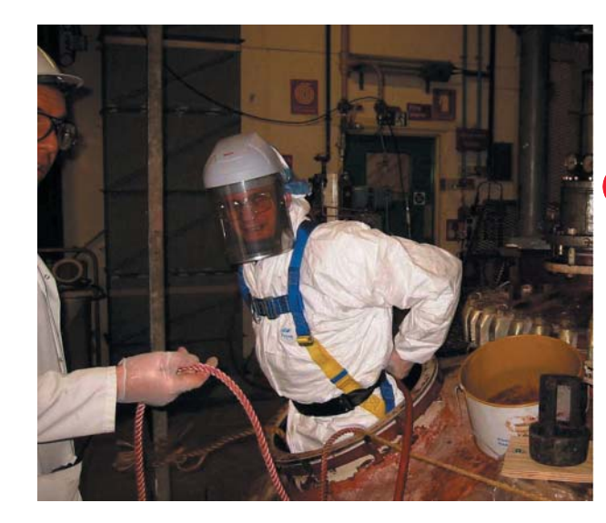
Figure 3 Vessel work requires a high level of personal protective equipment.

It has been postulated that the link between shift work and CVD is via three pathways—mismatch of circadian rhythms,