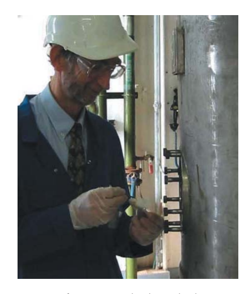
Figure 2 Testing safety systems in the chemical industry.

Occupational lead exposure is still common in some industries such as construction, lead smelting, and the manufacture of lead batteries, and unusual jobs such as in the production of leaded windows or repair of old pottery. Exposure to lead is said to cause rises in blood pressure levels. Environmental exposure to lead occurs via inhalation of exhaust fumes from leaded petrol and drinking water carried in lead pipes. The concentration of lead in the blood is easily measured. Regulation of workers in the lead industry ensures, via control measures, that blood lead concentrations are being reduced as far as is reasonably practicable via reduced exposure to lead. One recent review of annual epidemiological, occupational, and population studies demonstrated that even at low concentrations, lead was