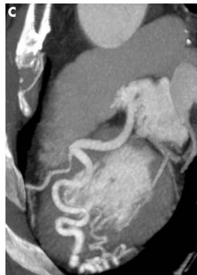
Sagittal view of MSCT showing coronary fistula terminating in the left ventricular cavity.

(26%), pulmonary arteries (17%), and less frequently the superior vena cava or coronary sinus, and least often the left atrium and left ventricle. The resultant physiologic derangement depends upon the site of origin and termination of the fistula and the size of the connection. The current case demonstrates that the size and anatomical features of a coronary–cameral fistula can be reliably established by MSCT, as opposed to conventional methods such as coronary angiography or with retrograde thoracic and aortic root aortography.