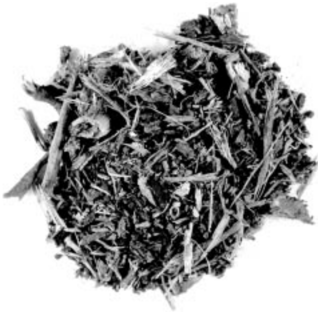
Figure 1 The traditional remedy (muti).

peritonitis and septicaemia and died three months after admission. A postmortem liver biopsy revealed mild fibrosis, hepatocellular necrosis, and the collapse of reticulin structure in zone 3, all of which are consistent with a diagnosis of VOD. The absence of the typical perivenular congestion was thought to result from the delay in biopsy, which was performed only three months after presentation.