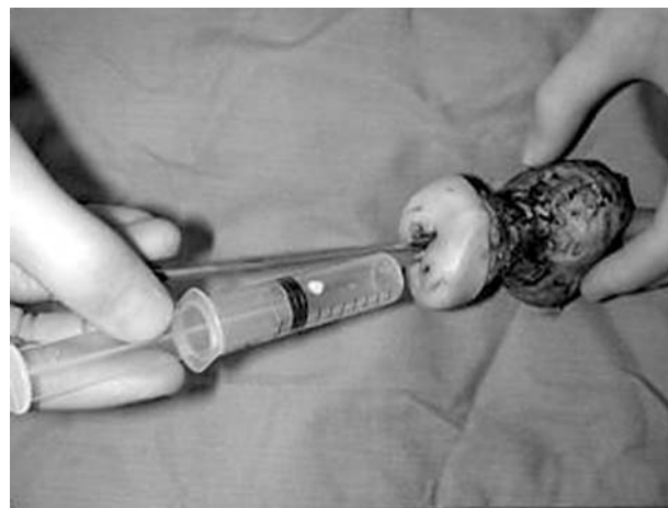
Figure 1 Method for injection of formalin through external cervical os into the endometrial cavity.

The age of the patients in the injected group ranged from 27 to 76 years (mean, 48) and in the control group from 30 to 79 years (mean, 47). The uterine weight in the injected group ranged from 29 to 886 g (mean, 147) and in the control group from 21 to 683 g (mean, 125). Table 2 shows the degree of autolysis in the injected and control groups. There was a highly significant difference between the two groups ( p < 0.001 ; Pearson \chi^2 = 24.012 ). Figure 2 is an example of an autolysis score of 3. The cervical sections were