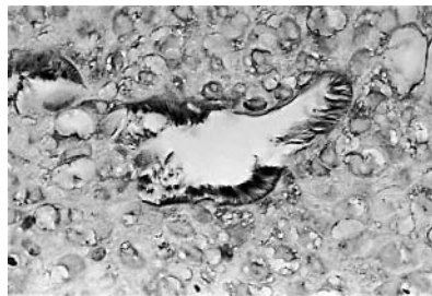
Figure 2 Gastric intramucosal bronchogenic cyst showing ciliated structures expressing tubulin B (immunohistochemical staining for tubulin B; original magnification, ×25).

was approximately 6 µm long and stained positively for tubulin B (fig 2). Staining with periodic acid Schiff diastase revealed only one positive clear cell. The aforementioned vacuolated cells were periodic acid Schiff negative. Staining for Ki67 (clone MIB1) showed no signs of epithelial proliferation.