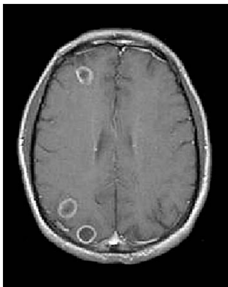
Figure 2 Magnetic resonance imaging scan of the brain showing four ring enhancing lesions in the cerebral cortex.