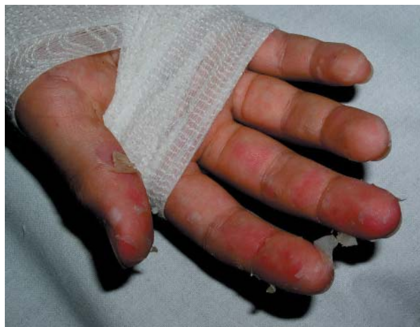
Figure 1 Desquamation of the fingers in a patient with rat bite fever, resembling that seen in the subacute phase of Kawasaki disease.

After five days of antibiotic treatment, the patient's general status improved. At this time he developed spectacular