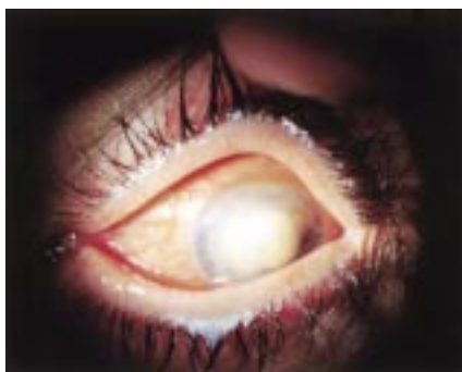
Figure 1 Left eye of 42 year old woman with invasive Fusarium solani keratitis/endophthalmitis after 8 weeks of maximal tolerated therapy with natamycin and amphotericin B.

Fusarium solani . Initial therapy with tobramycin was followed by high dose topical hydroquinolones, whereafter the infection, continuing unabated, was construed to be fungal keratitis. High doses of amphotericin B both topical and intravenously, natamycin, and ketoconazole were administered, along with topical fortified cephazolin, neosporin, and atropine. Despite these, the lesion spread to involve much of the corneal periphery (Fig 1), and repeat corneal cultures confirmed the presence of amphotericin B resistant Fusarium spp (MIC 24:48 hours in µg/ml: amphotericin B 2:2; natamycin 32:32; posaconazole 1:8).