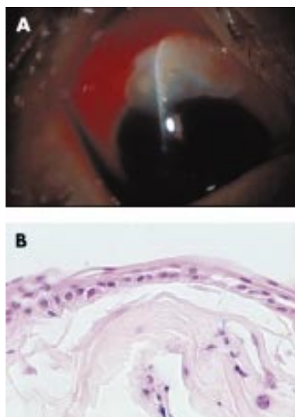
Figure 1 (A) Recurrent blebitis in case 1. Note the infiltrates inside the avascular, transparent bleb. (B) The histological study of the excised bleb from case 1 shows a one to two layered thin epithelium with goblet cell depletion and a poor inflammatory response (haematoxylin and eosin, original magnification, \times 150 )

Inflammatory reaction in the stroma of the bleb is decreased with the use of mitomycin C, 1,2,6-8 while cases of leaking blebs without antimetabolites reportedly show moderate subconjunctival inflammation. 3 Case 2 in the