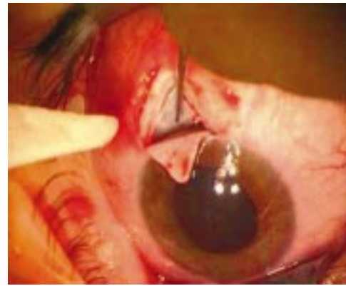
Figure 3 Intraoperative situs showing the SKGEL implant inside the scleral bed.

Postoperatively, the mean number of antiglaucoma medications was significantly reduced in both groups. However, there was no statistically significant difference between the two groups at each postoperative visit. At 12 months the mean number of antiglaucoma medications was 0.7 (SD 1.0) in the viscocanalostomy group and 0.6 (SD 1.0) in the VSRHAI group ( p=0.96 ) (Table 1). Compared to the baseline examination, the best corrected visual acuity and mean defect of visual field remained unchanged at the 12 month follow up visit in each group.