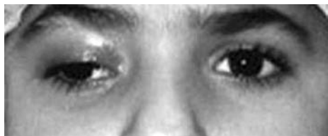
Figure 2 Case 3, preoperative alignment.