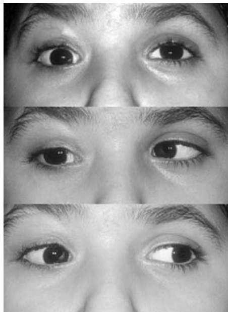
Figure 3 Case 3, postoperative alignment and horizontal rotations.

A boy aged 4 years old fell from the third floor onto the street sidewalk with resulting hemiparesis and right third cranial nerve paralysis. A frontalis sling operation was performed on the right upper lid 2 months after the injury to prevent amblyopia. Six months after the accident, the right eye position was 45 degrees exotropia and 10 degrees hypotropia (fig 2). There was no adduction or vertical movement. Lateral rectus disinsertion and reattachment to the orbital rim was performed, together with superior oblique tenotomy and medial rectus resection of 12 mm. The medial rectus was sutured 6 mm superior to the original horizontal line of insertion. Eighteen months postoperatively the right eye