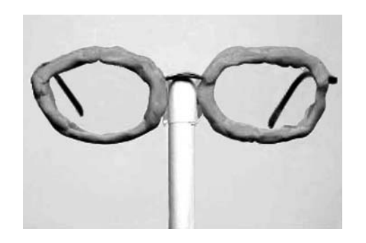
Figure 2 Tac 'N Stik<sup>®</sup> reusable adhesive around the edges of the eyeglasses used to prevent unmasking.

To assess the success of masking we asked the examiner to report what treatment he/she thought the child had received or if he/she was unsure. This question was asked after testing with the assigned reading glasses was completed. In addition, the children and parents were asked which treatment they thought they had received or if they did not know. The