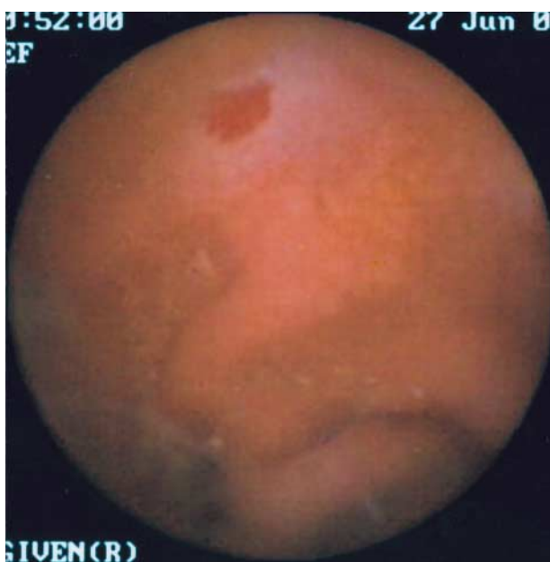
Figure 2 Angiodyplasia in the distal small bowel as a potential bleeding source seen on capsule image in a patient with occult bleeding. The angiodyplasia is located at 12:00 while the lumen of the bowel is hardly seen at 06:00.