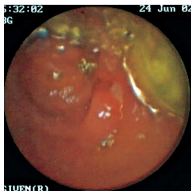
Figure 4 Small aphthous lesion seen in the distal small bowel. Several of these lesions were seen in this patient which were suggestive of Crohn's disease.

Crohn's disease 3 (fig 4), Meckel's diverticulum, 2 ulcerating proximal jejunitis, 1 ileal ulcer, 1 and ulcer due to intussusception. 1 The wireless capsule also made some diagnoses outside the small intestine: Cameron erosions in a large hiatus hernia, small gastric angiodysplasia (associated with small intestinal angiodysplasia) in two patients, a gastric ulcer, a caecal polyp, and a caecal angiodysplasia. All gastric abnormalities were confirmed at subsequent push enteroscopy; the colonic abnormalities were confirmed and treated at subsequent colonoscopy. Capsule endoscopy however failed to detect a Cameron lesion in one patient. This was detected at push enteroscopy. The total diagnostic yield of wireless capsule endoscopy was 38/50 (76%).