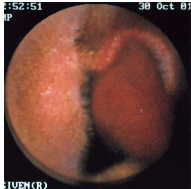
Figure 3 Focal active bleeding in the small bowel seen on capsule image. The dark red bleeding appears in the lumen.