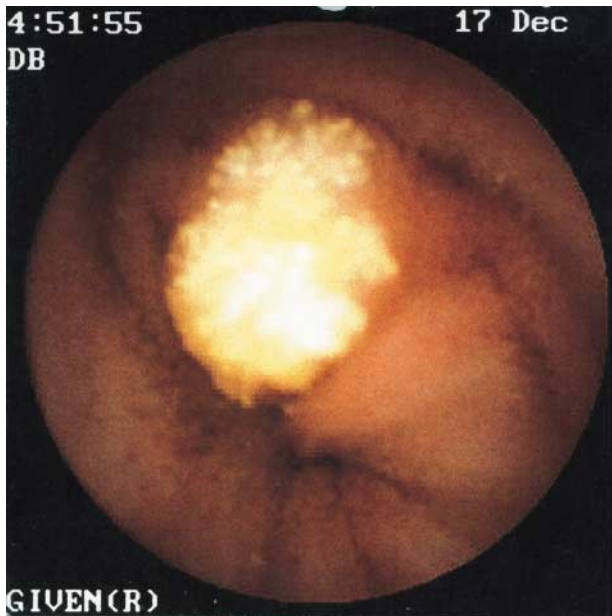
Figure 1 Large lymphangiectatic cyst seen on capsule image in a healthy volunteer.