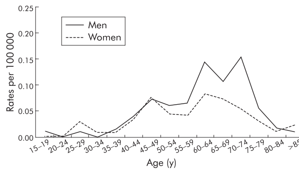
Figure 1 Age specific incidence rates of malignant digestive endocrine tumours in men and women.

Figure 1 shows the age specific incidence curves of MDET in men and women. MDET incidence rates were low and similar in both sexes before the age of 40 years. Thereafter the incidence rates increased more rapidly in men than in women until 75 years in men and 65 years in women. Then