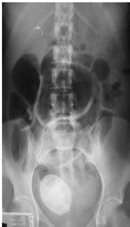
Figure 1 Abdominal radiograph showing a calcified mass in the pelvis.