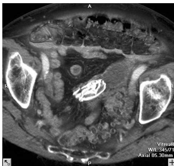
Figure 2 Computed tomography scan of the patient. The small bowel is dilated down to the level of the impacted stent. The large bowel is normal.