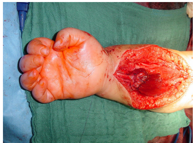
Figure 6 free functional gracilis transfer for finger flexors in a total lesion with flail hand.