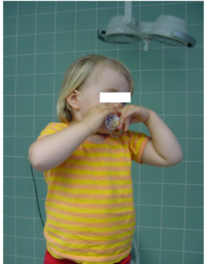
Figure 5 recovery of elbow flexion.