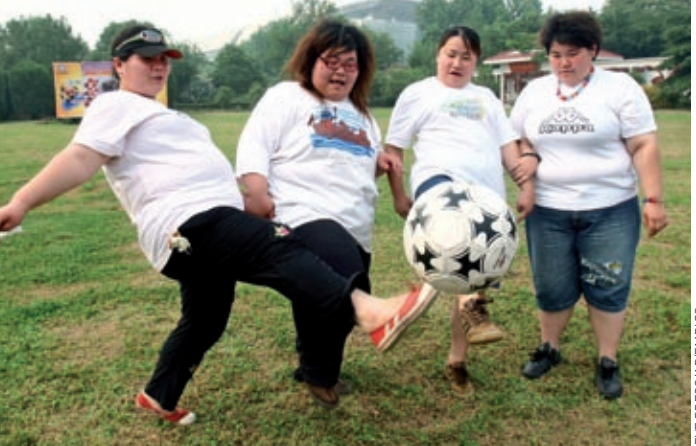
More than a quarter of Chinese women are now overweight

The authors say that applying the results to the Chinese population as a whole indicates that the prevalence of overweight and obesity in the general Chinese adult population is higher than previously reported. In 1991, the prevalence of overweight and obesity were 9.9% and 0.8% in men and 12.9% and